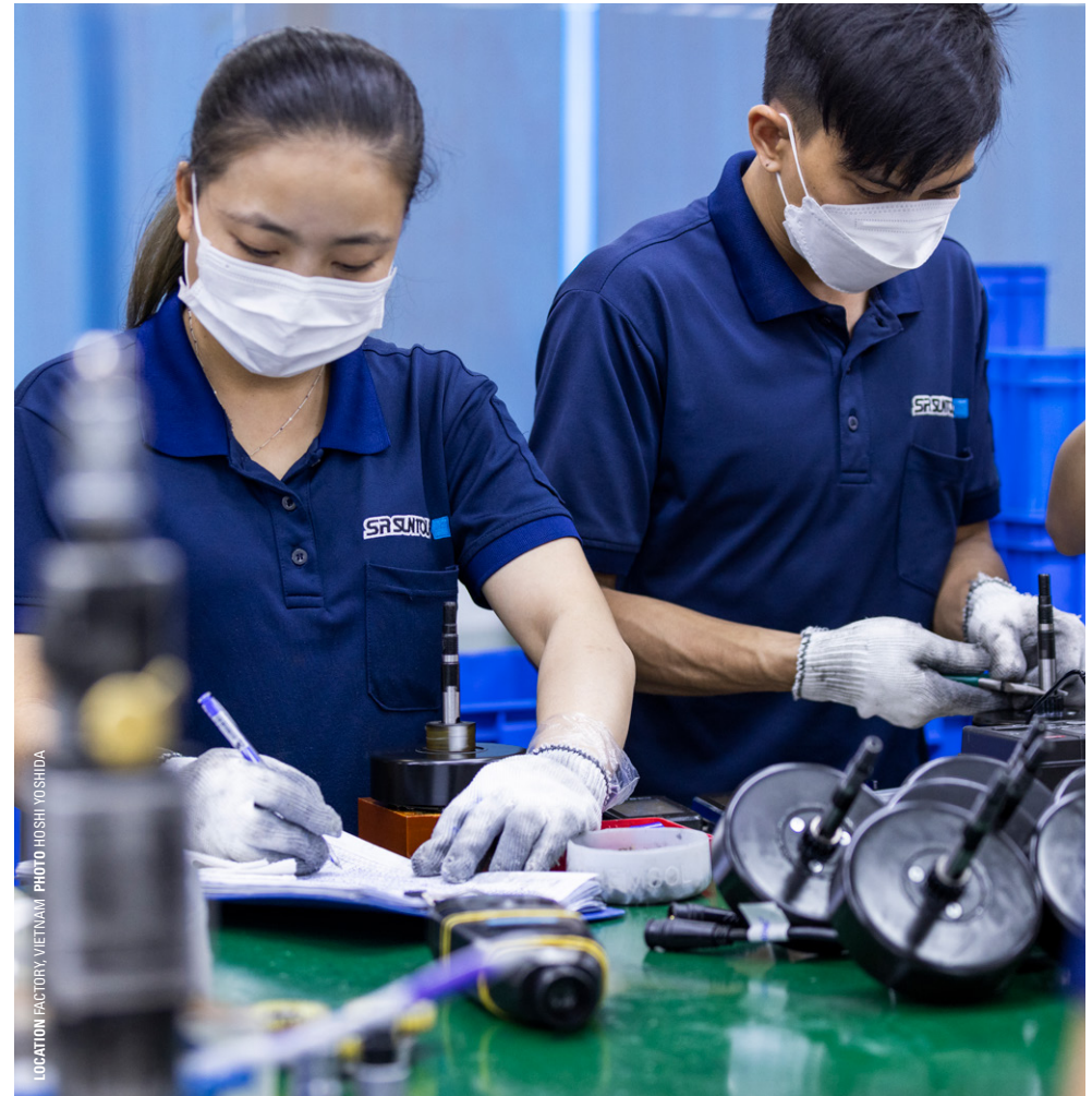
LOCATION: FACTORY, VIETNAM

all levels to contribute ideas, raise concerns, and offer feedback on organizational practices, policies, and workplace culture. This inclusivity promotes a sense of ownership and empowerment among employees, driving continuous improvement initiatives and enhancing overall organizational effectiveness. Moreover, soliciting and acting upon employee feedback demonstrates a commitment to valuing diverse perspectives, cultivating a supportive work environment, and aligning corporate governance with broader ESG objectives.