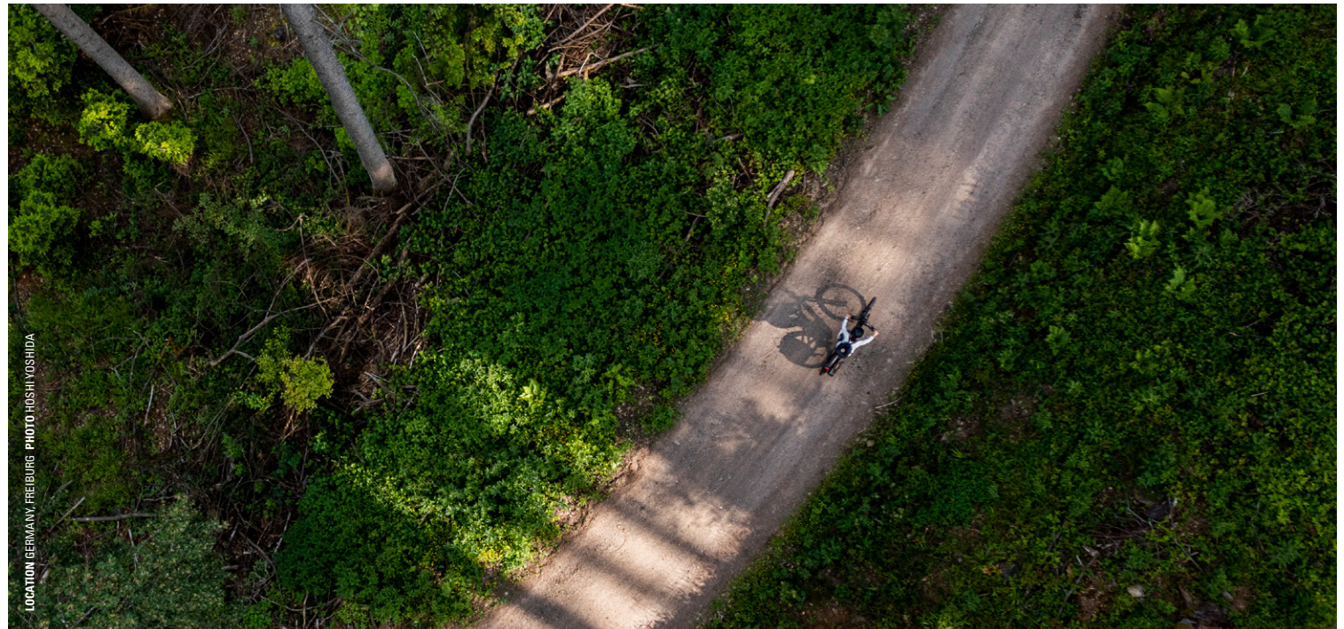
LOCATION GERMANY, FREIBURG

workplace environment, we not only meet regulatory requirements but also contribute positively to the communities where we operate. As we continue to evolve and grow, our dedication to ESG principles remains unwavering, ensuring that we contribute to a sustainable and equitable future for all stakeholders.