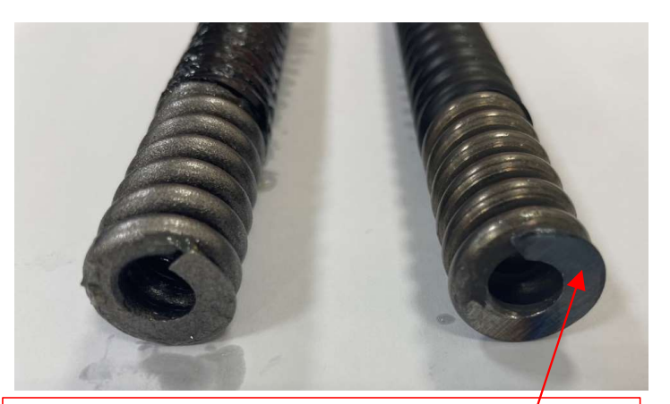
There are visible grinding and burn marks on both end of spring of fake product